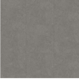
MBEG / .12424UPS 24 x 24