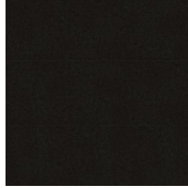
MBGB / .12424UPS 24 x 24