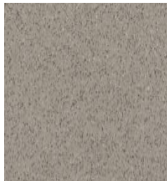
R001 > Grey Mingle 8 x 8