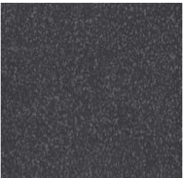
A880 > Onyx 8 x 8